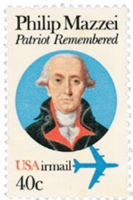
In 1980 USPS issued a 40c airmail stamp with portrait of Philip Mazzei... Patriot Remembered